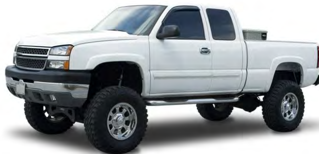
The Right Solution