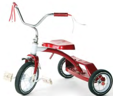
Pen and Paper